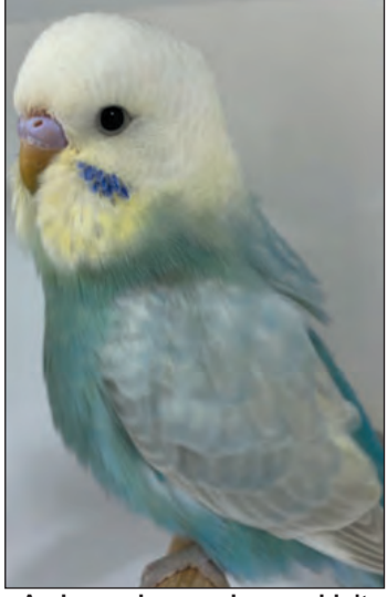
And you, dear reader, wouldn't you like a Violet-Sky White Cap Rainbow? Just look at those colours. Well you can't exhibit one if you breed or buy it other than in a class for mongrels: AOV or AOC. The Australian Heritage

Budgerigar Association is committed to supporting beautiful budgies and is deeply committed to supporting new varieties and colours that our members want.