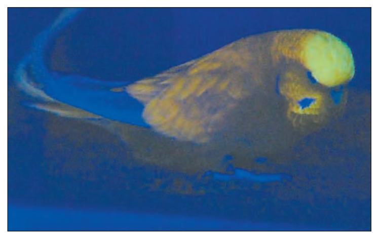
Above is a budgie in a very dark room lit by black UV lighting. These colours are invisible to humans, but they glow under UV black lights.