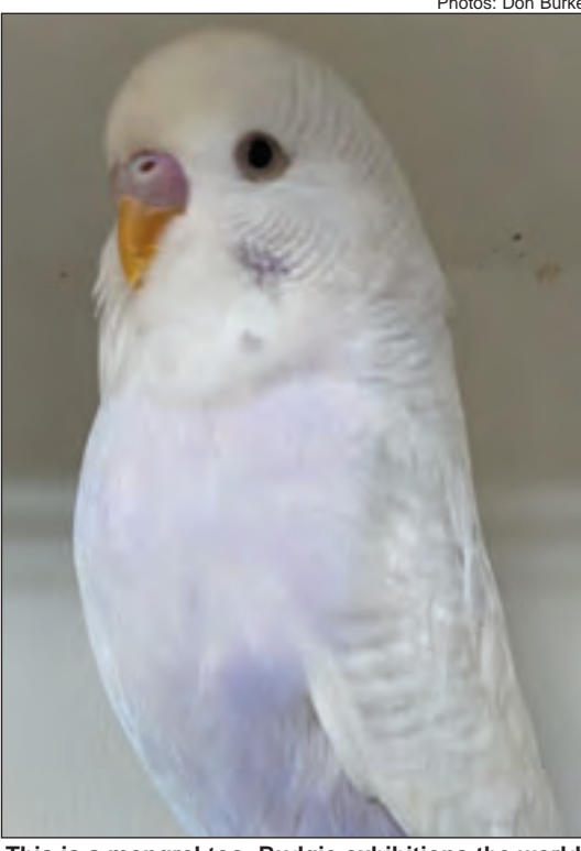
This is a mongrel too. Budgie exhibitions the world over will reject this pinkish-lavender mongrel, another rubbish bird. It is a Red Violet Clearwing Fallow but clearwing fallows have no respectable place at budgie exhibitions.

budgie club members have no say in it. A simple club for breeders of pretty little budgies is weighed down in undemocratic bureaucracy. But there are other pretty little budgies on the outer.