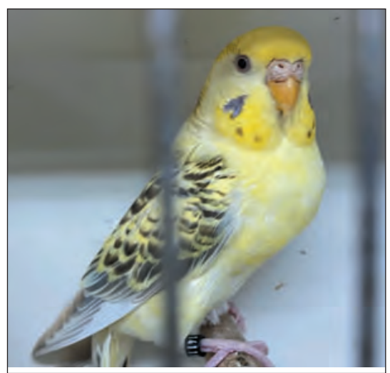
And what about Opaline Fallows, above. Surely someone would love to breed them, with their pink eyes?