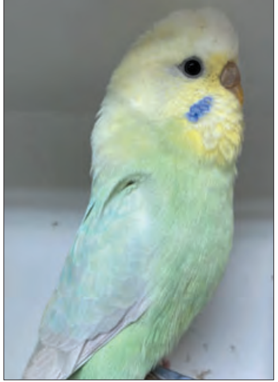
Technically this bird is rubbish, a mongrel. It matters not that it is beautiful. It is a White Cap Seafoam Cinnamonwing Rainbow and a nice one at that. But it belongs nowhere because an invisible committee of old men decided that and

budgie club members have no say in it. A simple club for breeders of pretty little budgies is weighed down in undemocratic bureaucracy. But there are other pretty little budgies on the outer.