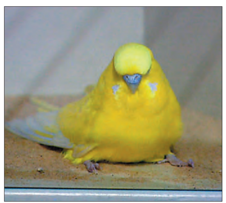
Above is a lutino hen under normal light. Below, under black UV lights in a darkened room, she looks entirely different.