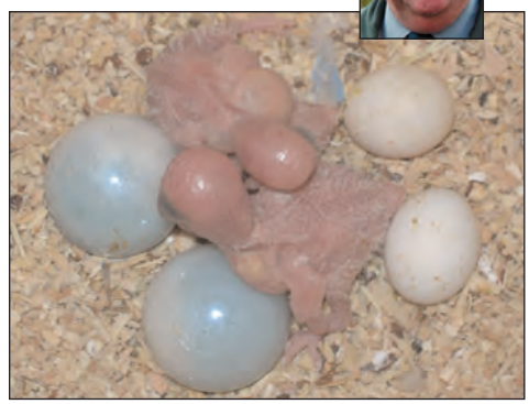
Marbles reduce chances of squashed chicks.